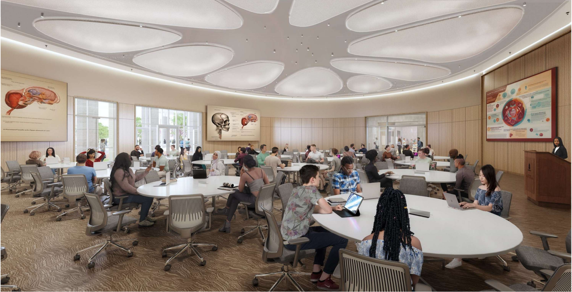
Attachment: USC Health Sciences Campus Updated 2025v3 (10363 : USC Health Sciences Campus)