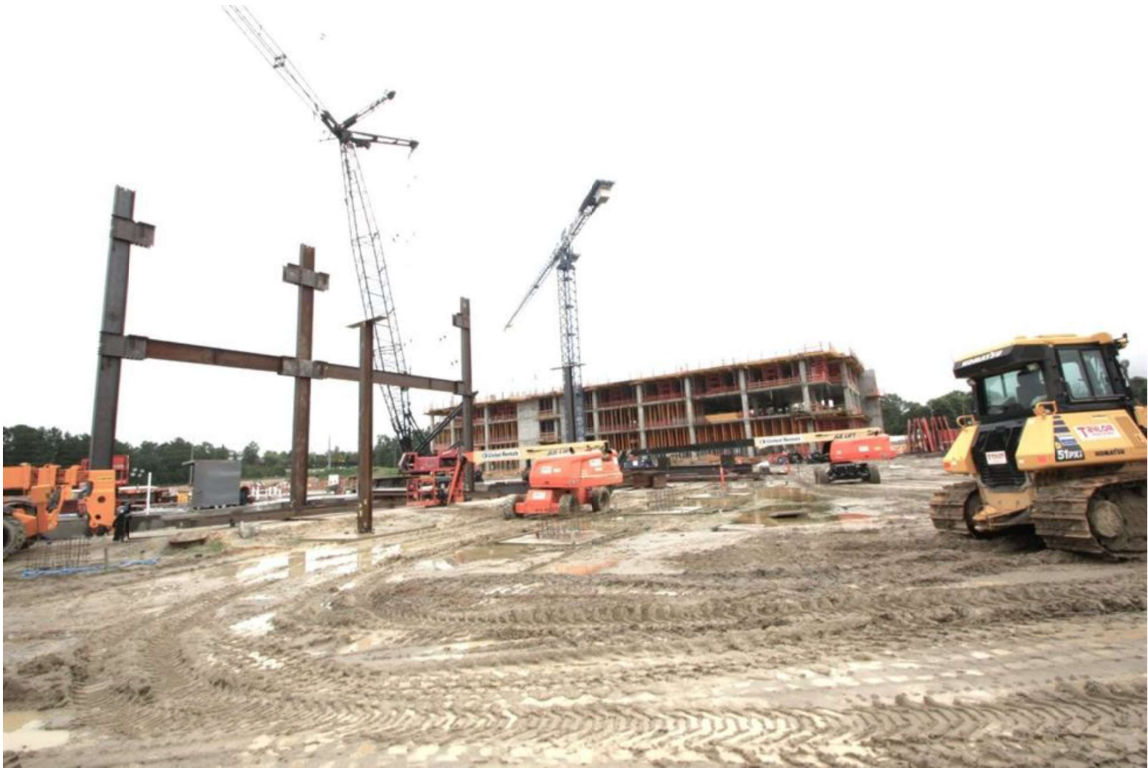
Attachment: USC Health Sciences Campus Updated 2025v3 (10363 : USC Health Sciences Campus)