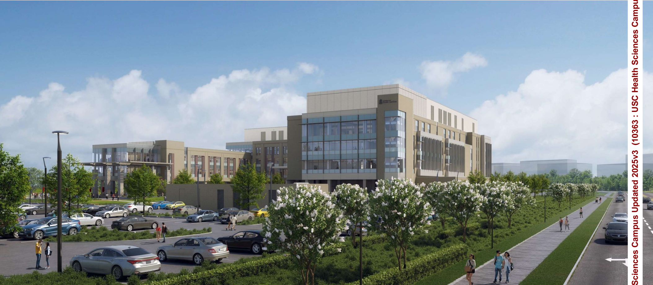
Attachment: USC Health Sciences Campus Updated 2025v3 (10363 : USC Health Sciences Campus)