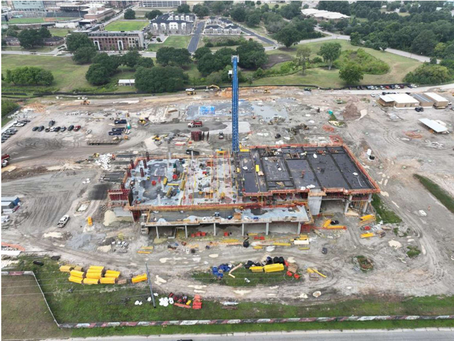
Attachment: USC Health Sciences Campus Updated 2025v3 (10363 : USC Health Sciences Campus)