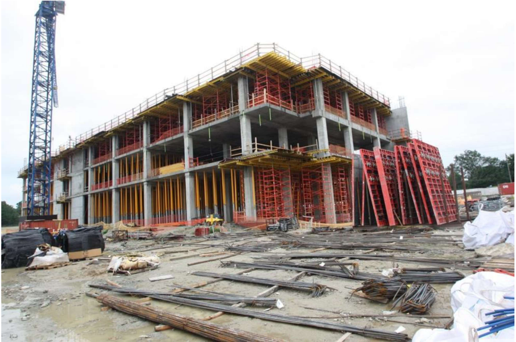
Attachment: USC Health Sciences Campus Updated 2025v3 (10363 : USC Health Sciences Campus)