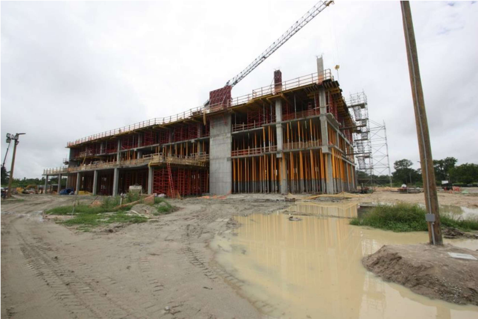
Attachment: USC Health Sciences Campus Updated 2025v3 (10363 : USC Health Sciences Campus)