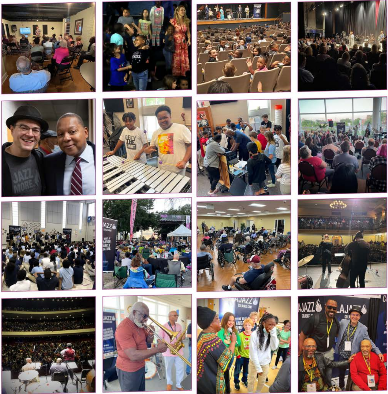
Attachment: 2023-ColaJazz-Impact-Report-1 (9212 : ColaJazz Impact Report)

To support a full creative life for all, the ColaJazz Foundation commits to championing policies and practices of cultural equity that empower a just, inclusive, equitable community. In 2021, the ColaJazz Foundation was the recipient of South Carolina’s most prestigious award for our service in the arts! The Governor’s Awards for the Arts is the highest honor the state gives to recognize outstanding achievement and contributions to the arts in South Carolina.